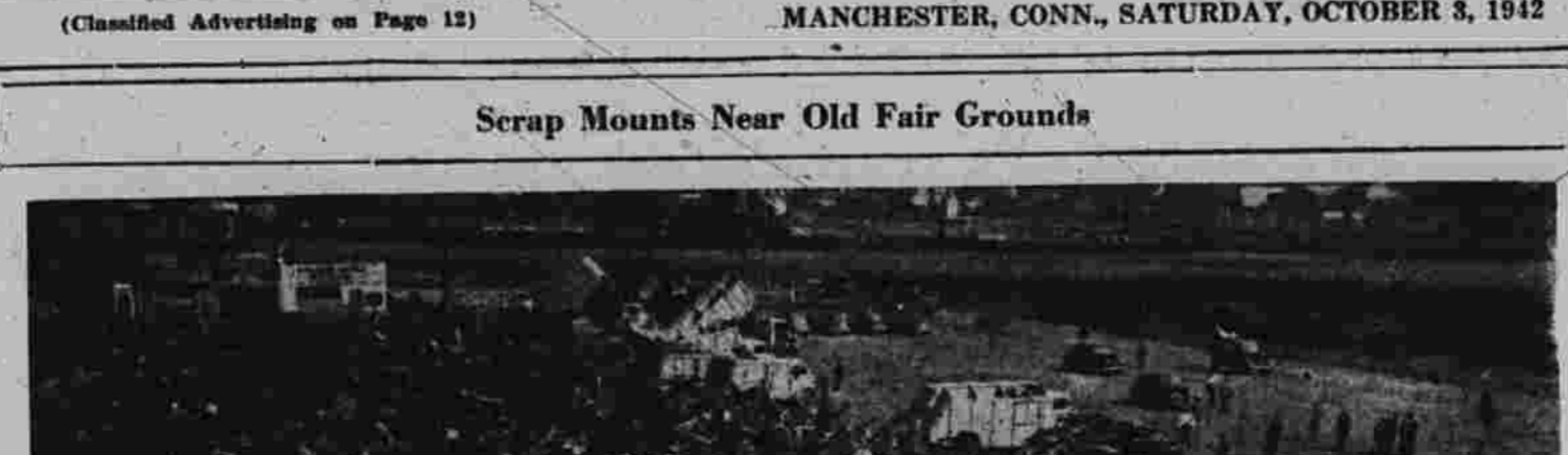
Scrap Mounts Near Old Fair Grounds On one of the parking spaces of the old World's Fair grounds in Flushing Meadows, New York city, rises a mountain of scrap metal...